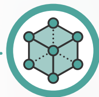
Framework for Implementation and Control

Processes that give you the confidence to say, "Yes, it's time to open again."