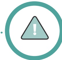
Assess critical activities