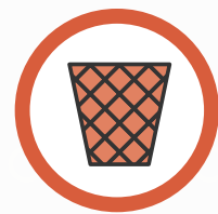
Hygiene & Health

With Sodexo Centralized Waste Collection Solutions, you can simplify your facility waste collection while promoting proper hygiene and health. You can also optimize spaces, costs, and efficiency. By replacing multiple, randomly located trash receptacles with strategically placed waste stations, you can also improve convenience and boost sustainability programs with separate receptacles for garbage and recyclable materials.