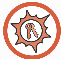
UV for Personal Items