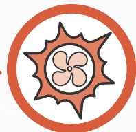
UV-C for Airstream

Sodexo UV disinfection systems can be installed in new construction or retrofitted to accommodate existing spaces.