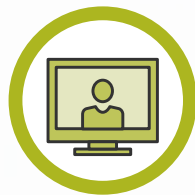
LCD Screens & Posters