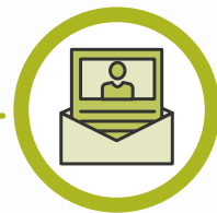
Email & Print

Building health and wellbeing awareness to encourage active and safe lives